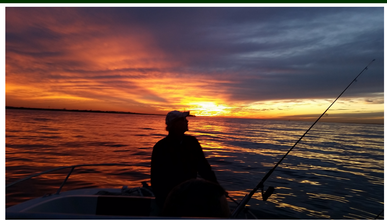
GMPP: Gone Fishin'